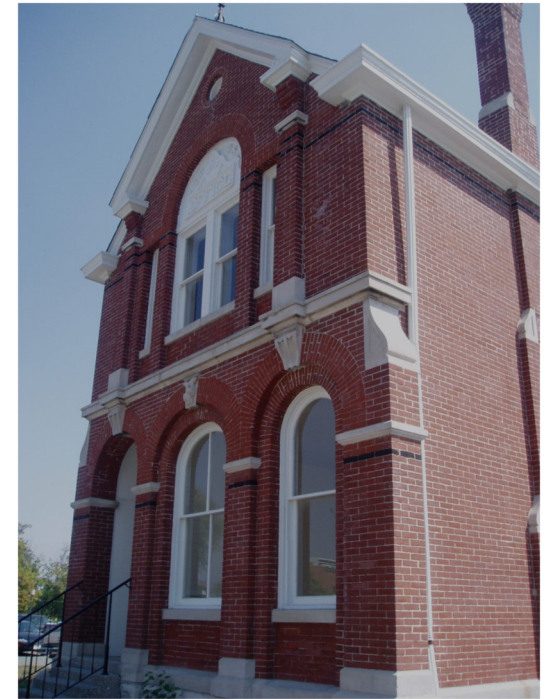
Hack & Simon Brewery Office, ca. 1885