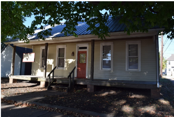
Hilt House, after (above) and before (below).

VKPF saved this house, located on Seminary Street around the corner from the Old French House, from demolition. With support from Indiana Landmarks, VKPF stabilized the house and rehabilitated the exterior. VKPF now uses the house for events and to store architectural salvage.