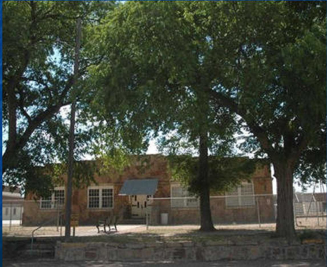
Wiley Rock Schoolhouse, now the Wiley Community Center Wiley, Colorado