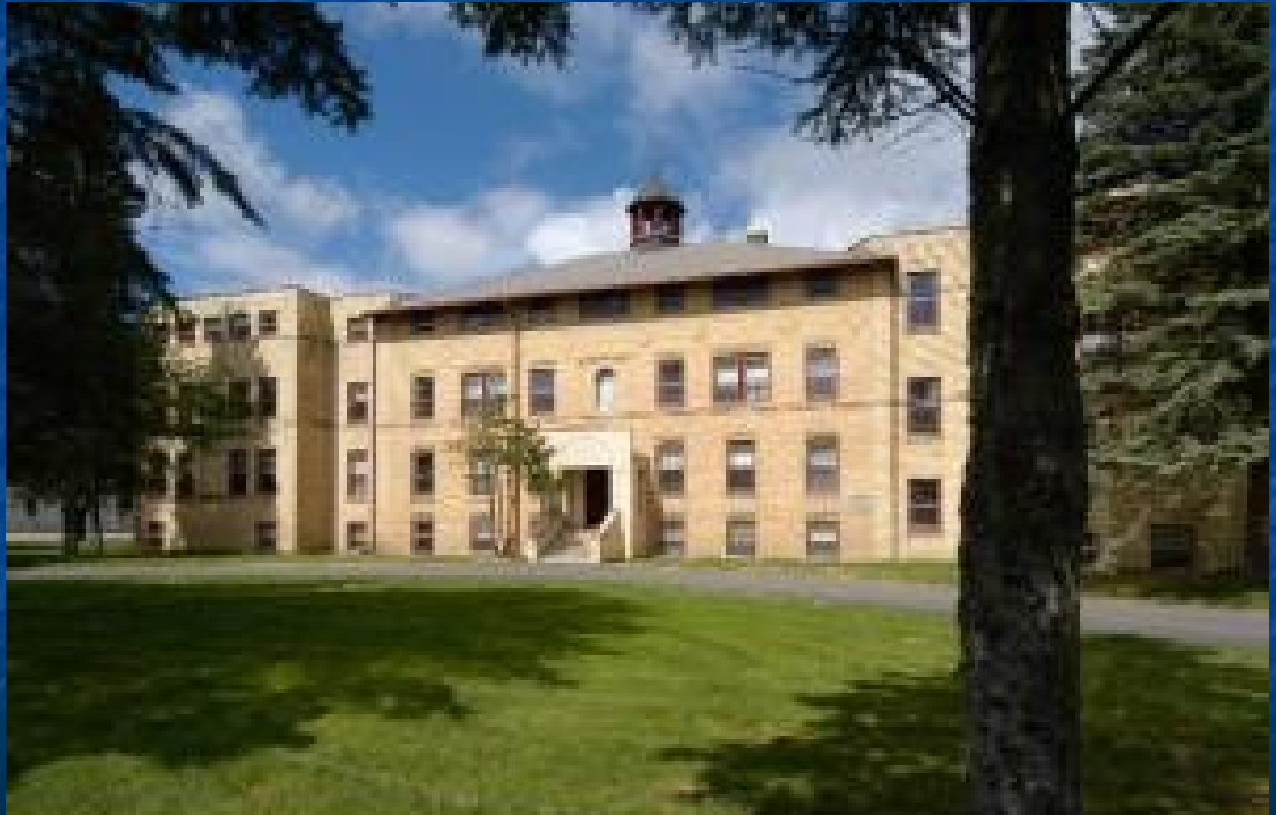
Holy Angles Academy, now Riverwood Pines Little Falls, Minnesota