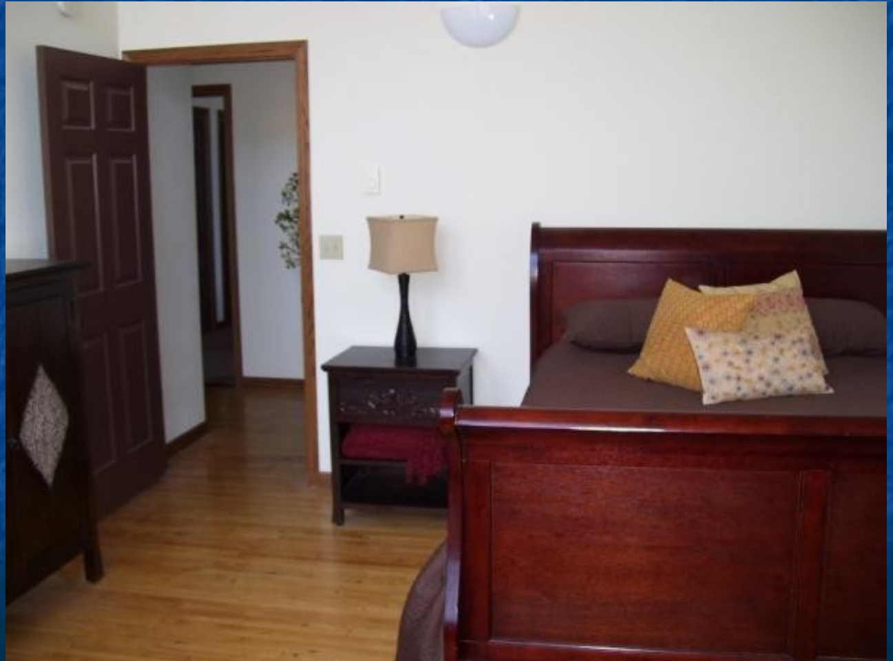
Brookings High School, now 1921 Offices and Apartments Brookings, South Dakota