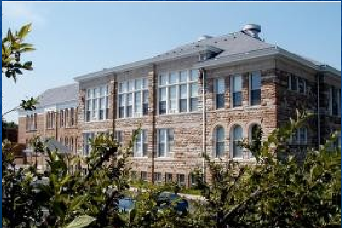
Cannon Falls, High School, now the Stonehouse Apartments Cannon Falls, Minnesota