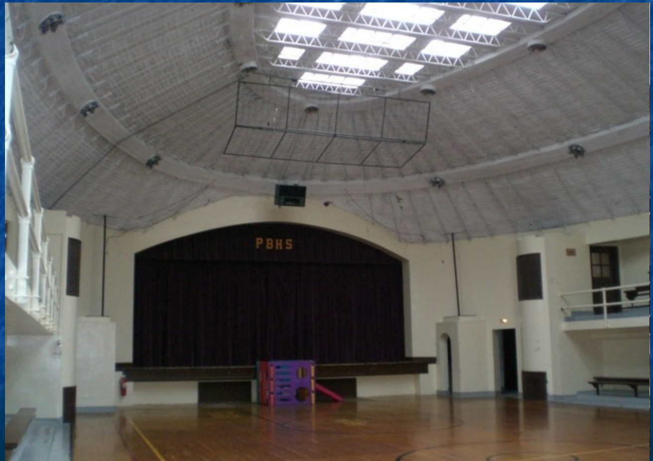
Pine Bluff High School, now the Pine Bluff Community Center Pine Bluff, Wyoming