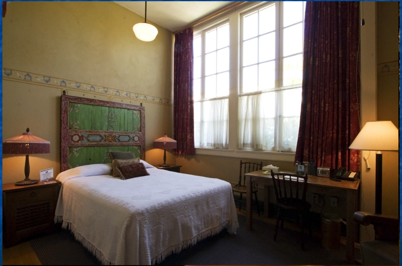
Kennedy Elementary School, now McMenamins Hotel & Pub Portland, Oregon