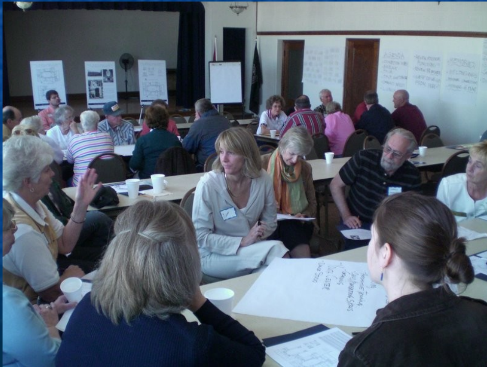
Community Design Charrette Pine Bluff, Wyoming

Brainstorm (then test) Survey Potential Users Community Charrette