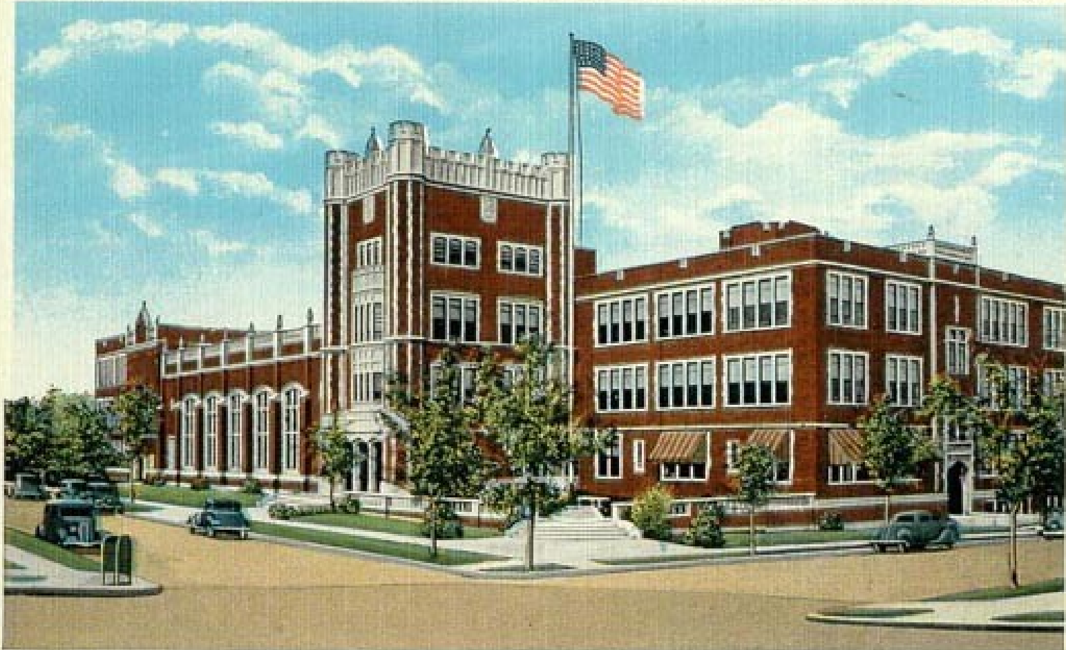
1135 Natrona County High School, Casper, Wyoming