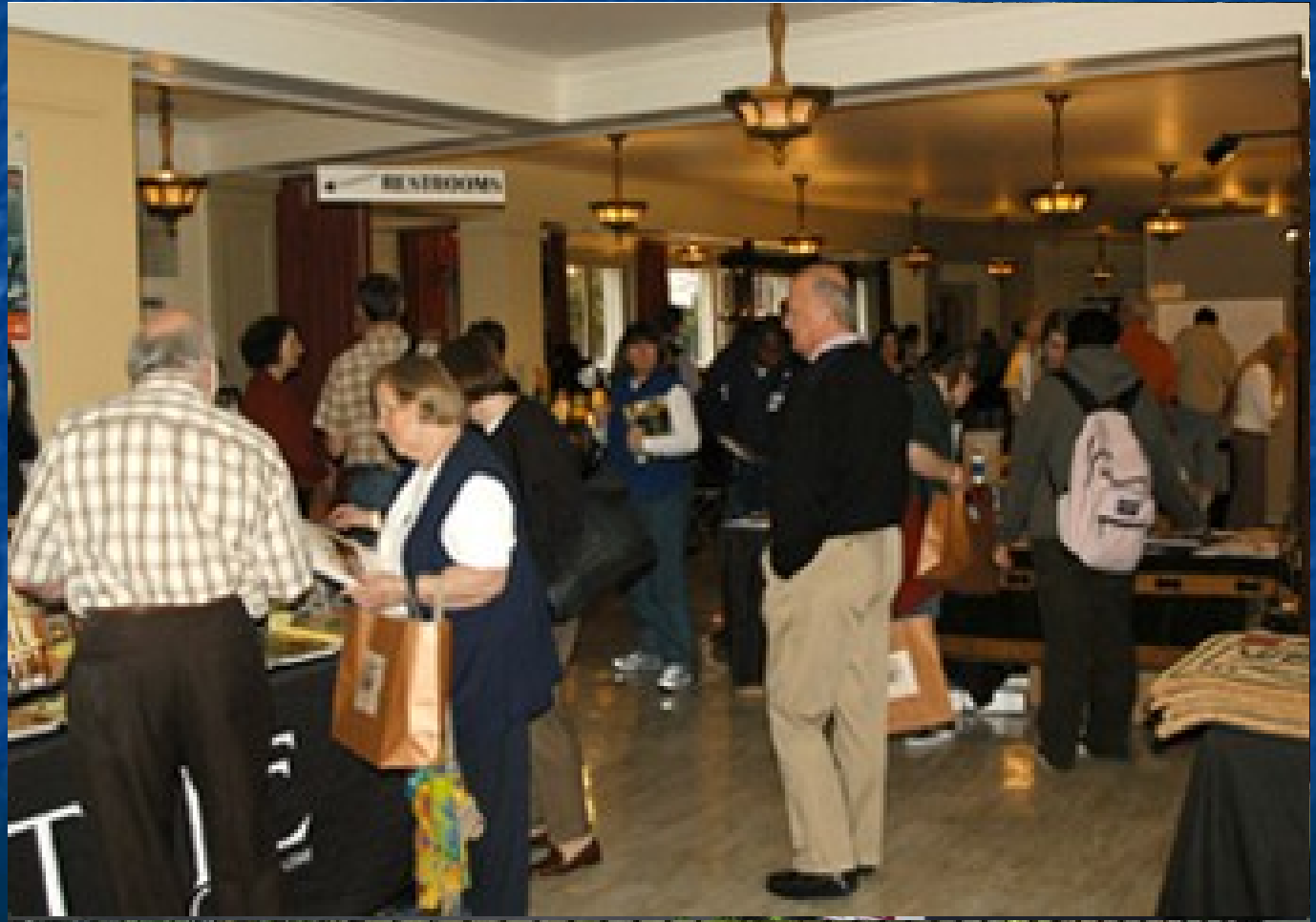
Interlake Public School, now the Wallingford Center Seattle, Washington