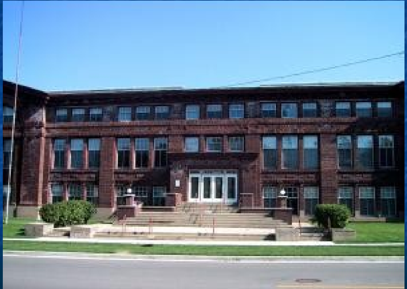
Belvedere High School, now the Pearl Place Senior Apartments Belvedere, Illinois