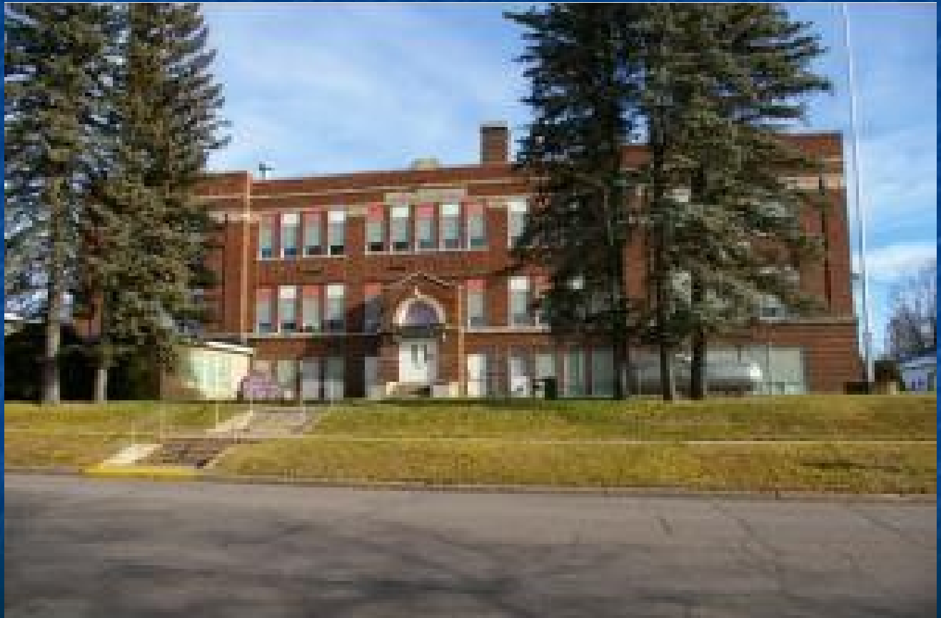
Lincoln Elementary, soon to be Lincoln School Apartments Park Falls, WI