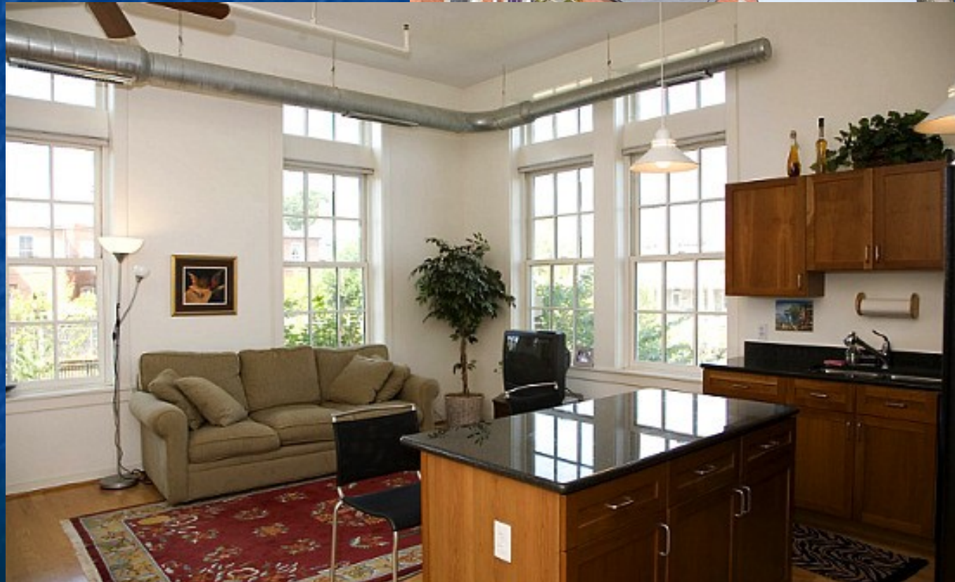
Lovejoy Elementary, now the Lovejoy Lofts Washington, DC